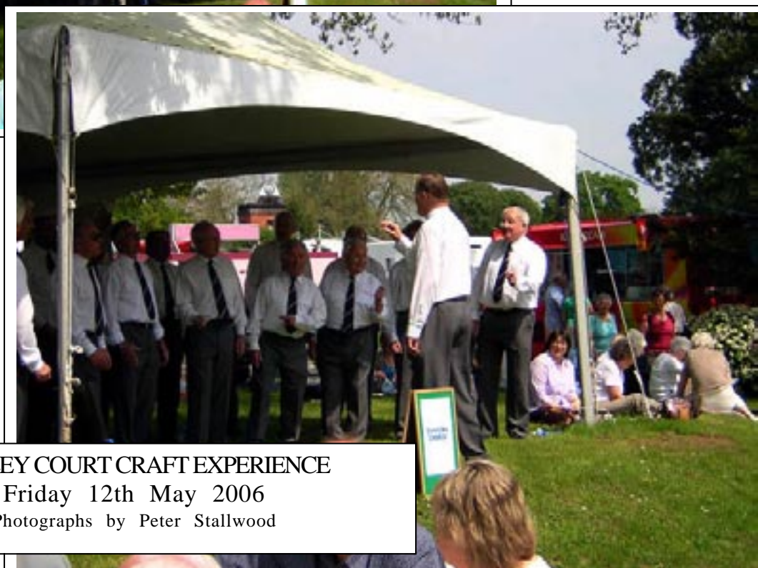
FAWLEY COURT CRAFT EXPERIENCE Friday 12th May 2006