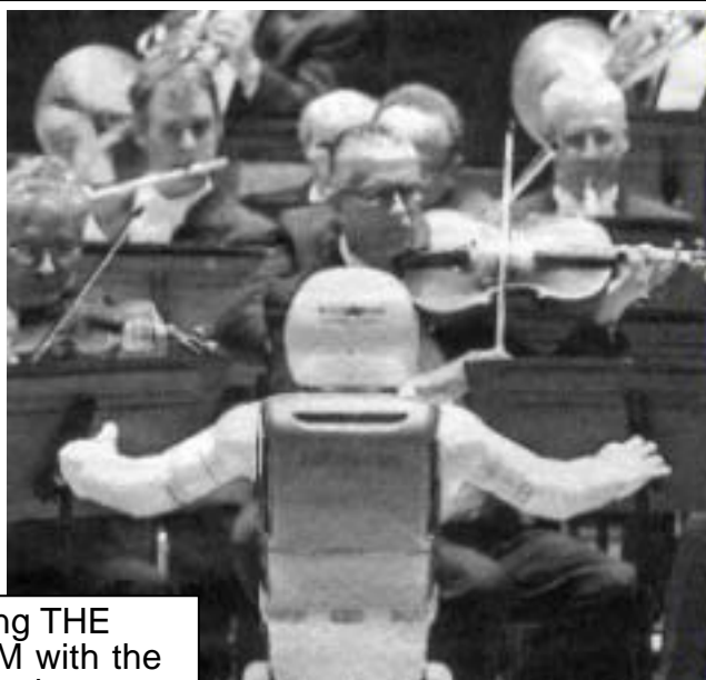
ASIMOV conducting THE IMPOSSIBLE DREAM with the Detroit Symphony Orchestra