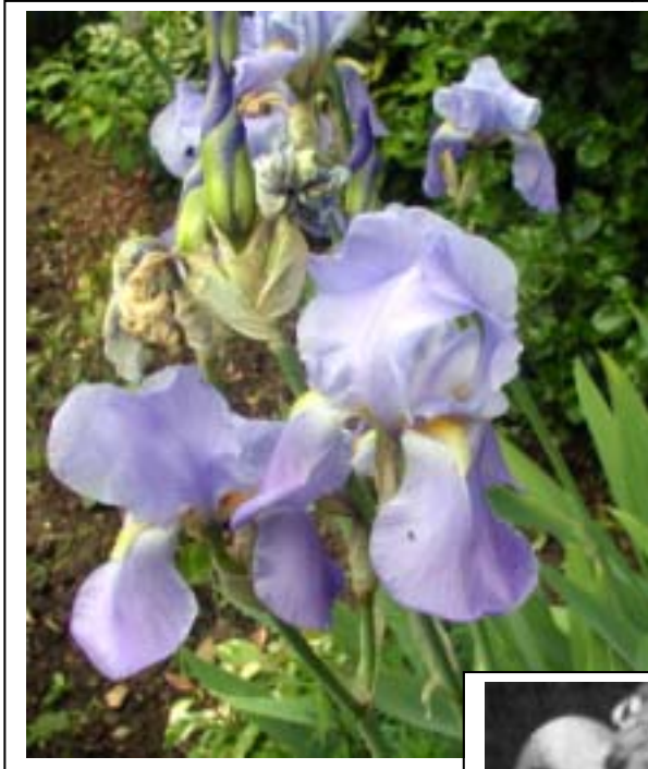
Geoff Sassé's Iris in full bloom at Kibblewhite Crescent